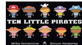
Ten Little Pirates