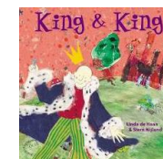
King and King

To understand why people, choose to get married.