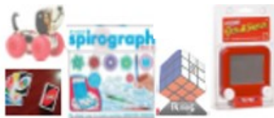
Toys 60 years ago (1960s)

These are the toys that your older relatives would have played with at your age. Some of the toys from this time in history are similar to the toys we play with now, like Play Doh and the game Twister. They might look different to the modern versions because of different packaging designs .