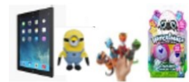
Toys in the present day

Toys from this time are older than modern day toys but newer than 1960s toys.