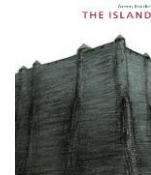
The Island – Armin Greder