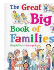
The Great Big Book of Families