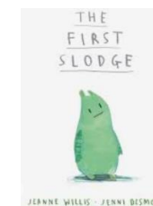
The First Sledge