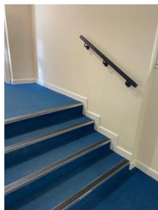
The external ramp connecting the Y2/3 classrooms to the library and Y4/5/6 classrooms (also accessible via an external ramp).