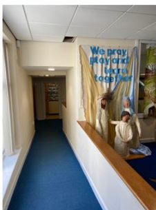
The internal ramp connecting the foyer with the junior classes.